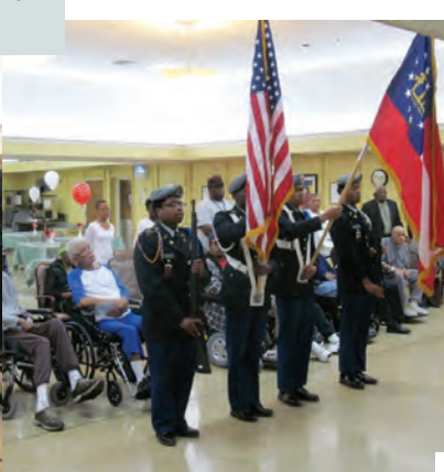
B.E.S.T. Academy JROTC presents the Colors & Pledge at the Veteran's Day program on Nov. 11.