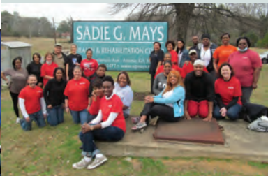
Volunteers from RICOH posed together after working at SGM for the M.L. King Day of Service on Jan. 16.