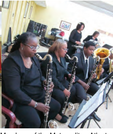
Members of the Metropolitan Atlanta Community Band perform at the Annual Thanksgiving Concert at SGM on Nov. 19.