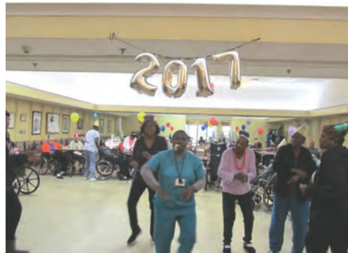
Staff and residents "bust a move" at the 2017 New Year's social.