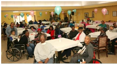
Attendees of the SGM 72nd Anniversary Celebration on March 23, 2019.