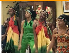
Total dancers perform at Kwanzaa program.