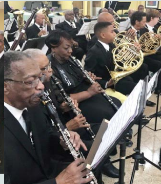
Metropolitan Atlanta Community Band performs their 7th Annual Thanksgiving Concert on Nov. 24, 2018.