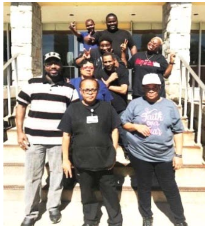
Dietary staff pose for a group photo in honor of Dietary Week in October.