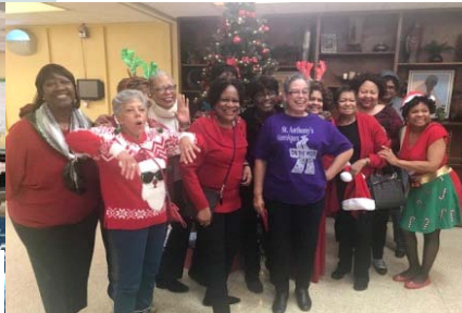
The Keenagers of St. Anthony of Padua Catholic Church brought music and humor to audiences at the Xmas Tree Lighting.