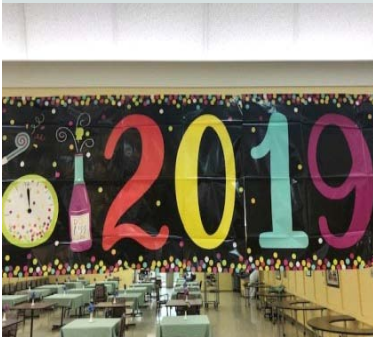
Happy New Year sign decorates the Dining Room for the celebration.