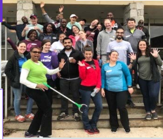
Teamworks volunteers from Hands On Atlanta pose after working at SGM on Feb. 16.