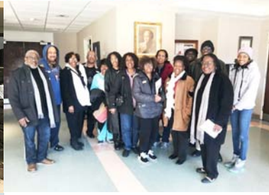
Volunteers from Greenforest Community Baptist Church visited residents at SGM on M.L. King Day, Jan. 21.