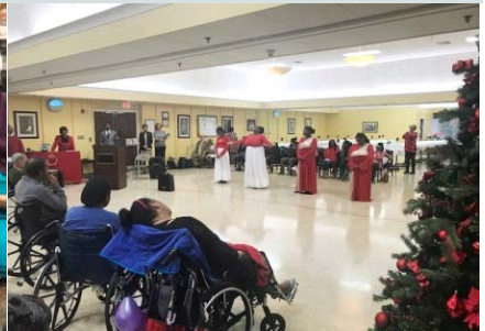
Residents enjoy dancers at the Annual Christmas Tree Lighting program.