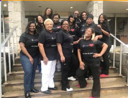
Staff members wear matching t-shirts to promote Women's Heart Month in February.