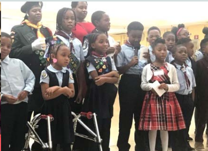
Children from the West End Mountaintop Adventure Club sing at the Annual Christmas Tree Lighting on Dec. 6, 2018.