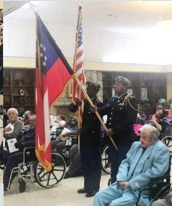
B.E.S.T. Academy ROTC presents the colors at Veterans Day Salute on Nov. 9, 2018.