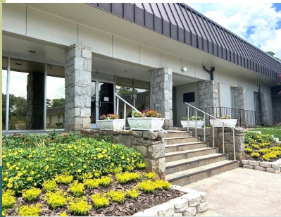
Our exterior was refreshed with gray paint, new soffits, and more.

Mark your calendar! 25th Annual COMMUNITY HEALTH FAIR THURSDAY, MAY 23, 2024 10:00 a.m. - 1:00 p.m. Health Screenings, Information, Entertainment, Snacks & More!