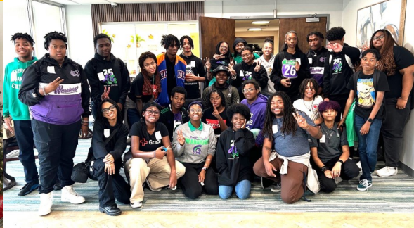
Students from KIPP Atlanta Collegiate Academy brought Thanksgiving decorations and good cheer to our residents.