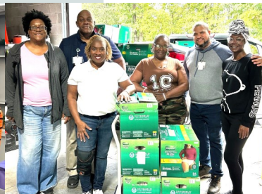
Staff and volunteers of EBC Cares donated cases of adult briefs .