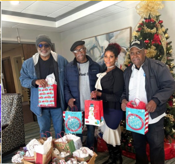
Members of Greater Elizabeth Missionary Baptist Church brought Xmas gifts.