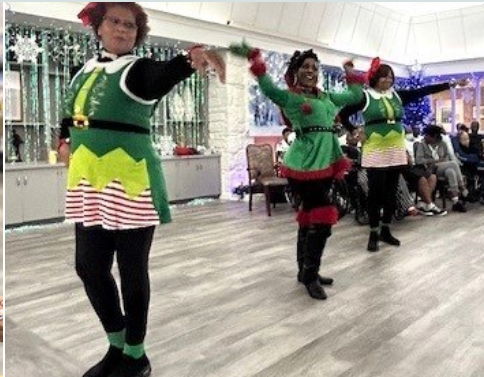
"Elves" aka SGM Activity Dept. team members, dance in the "Winter Wonderland" Program.