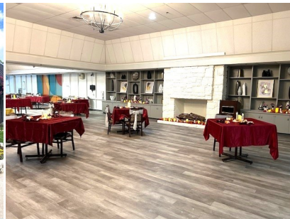
The dining room now boasts new furnishings, flooring, and décor.