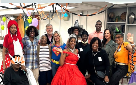
Volunteers from the Atlanta Senior Care Network Niche( ASCNN) had fun with residents and staff at the Halloween Fright Fest on Oct. 31.