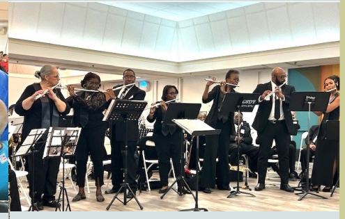
Members of the Metropolitan Atlanta Community Band's "Flute Nation" perform at the annual Thanksgiving Concert on Nov. 18.