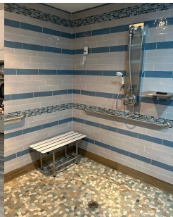
Here's a newly renovated shower room.