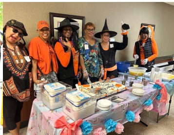
The Keenagers of St. Anthony's Catholic Church brought Halloween fun and treats for the October birthday party!