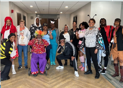
Residents and staff participated in a Halloween costume contest.